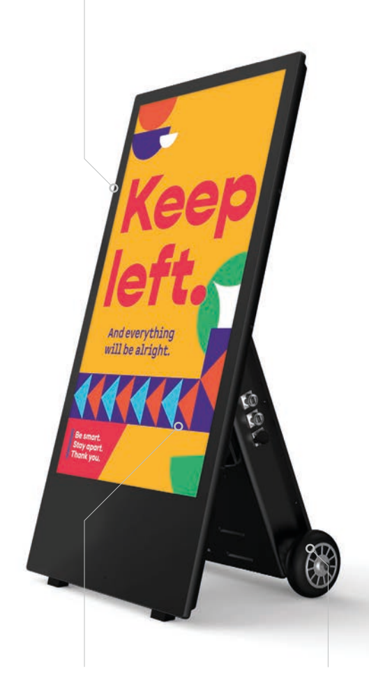
ULTRA RESISTANT TO BLACKENING DEFECT